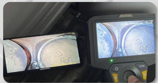
Hawkeye® X-PLOR using WiFi iOS and Android